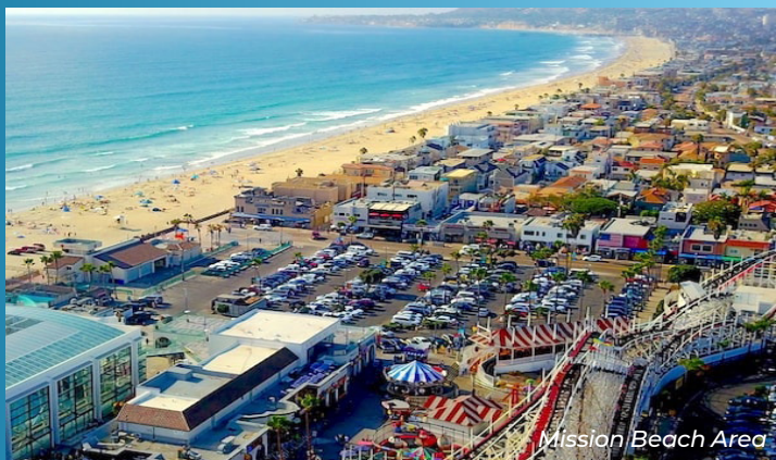
Mission Beach Area