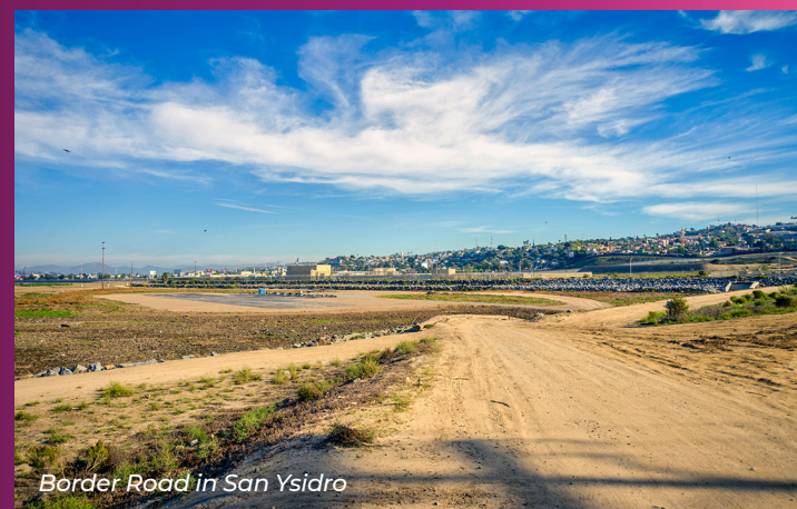
Border Road in San Ysidro