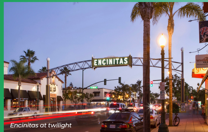
Encinitas at twilight