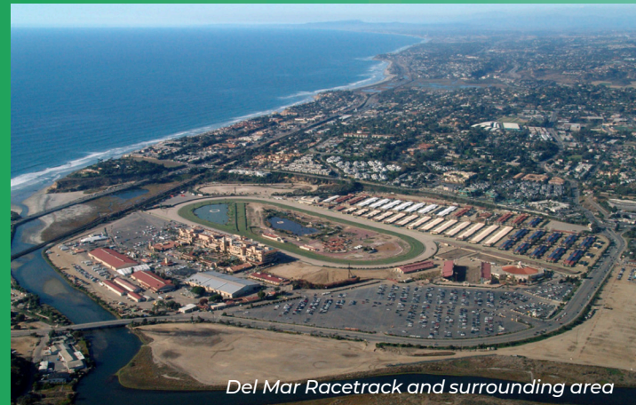
Del Mar Racetrack and surrounding area