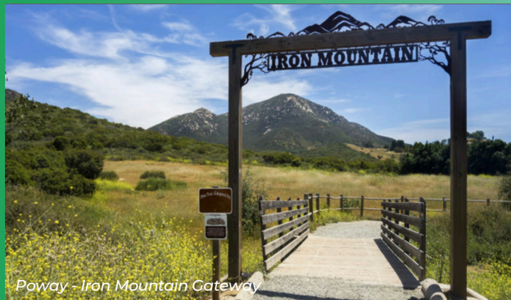
Poway - Iron Mountain Gateway