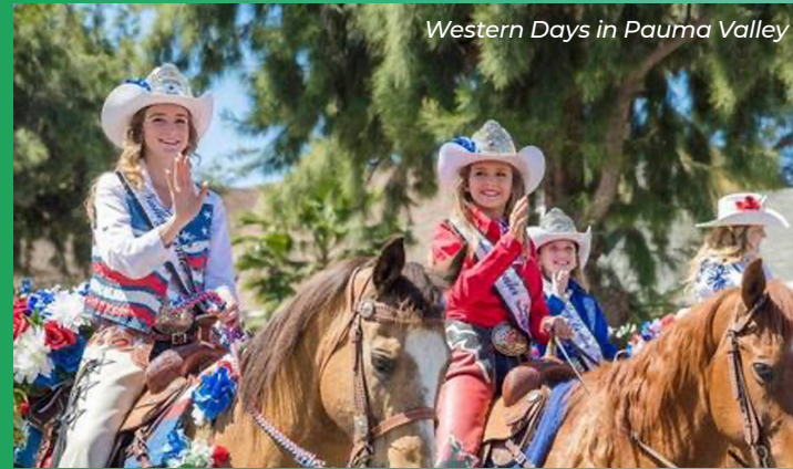
Western Days in Pauma Valley

https://californiathroughmylens.com/ranchita-yeti