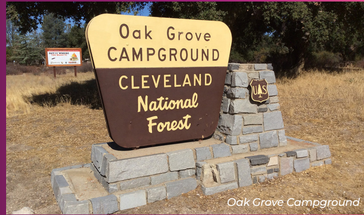
Oak Grove Campground

https://en.wikipedia.org/wiki/Pacific_Beach,_San_Diego