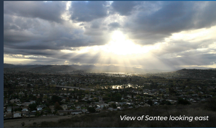
View of Santee looking east

https://en.wikipedia.org/wiki/Warner_Springs,_California