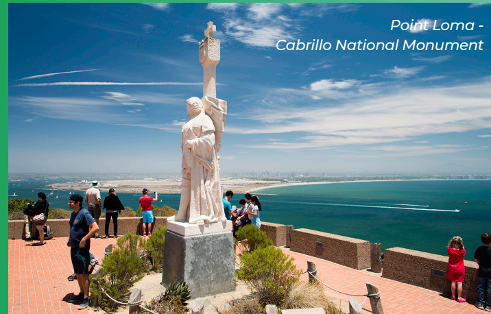
Point Loma - Cabrillo National Monument