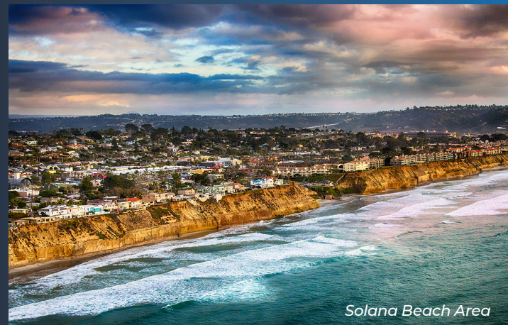
Solana Beach Area