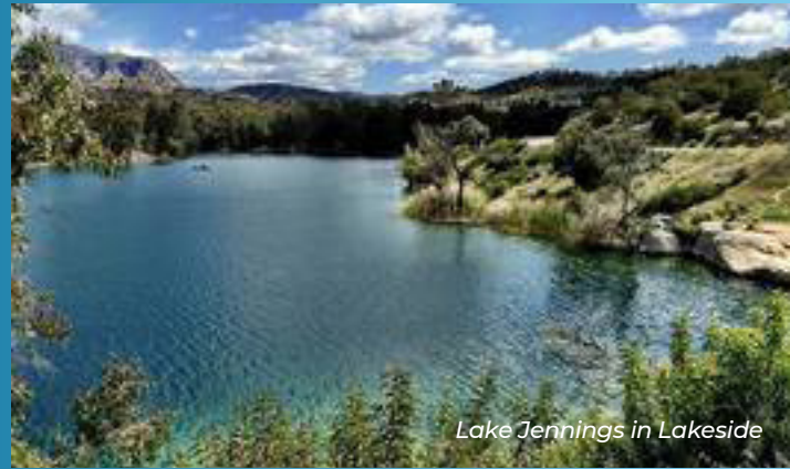
Lake Jennings in Lakeside

https://sites.astro.caltech.edu/palomar/homepage.html