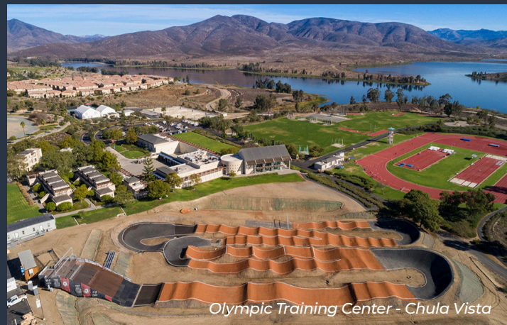
Olympic Training Center - Chula Vista