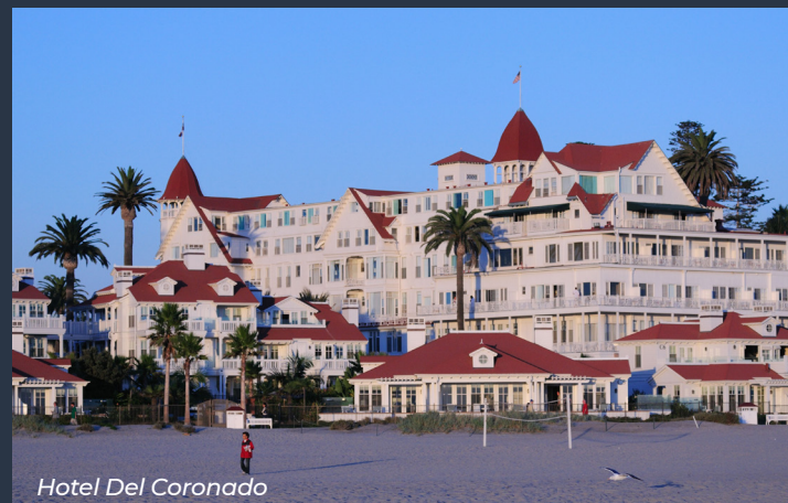
Hotel Del Coronado