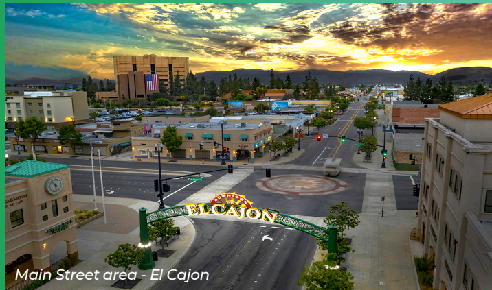
Main Street area - El Cajon