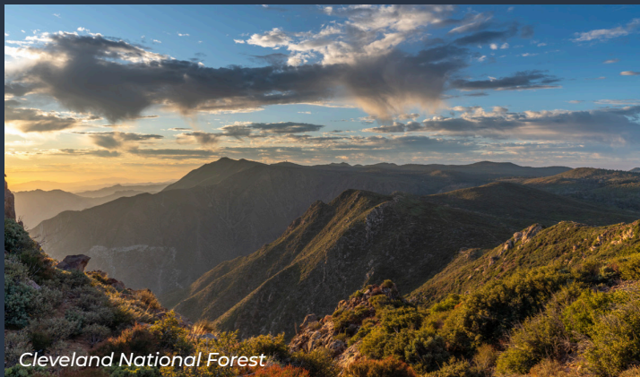
Cleveland National Forest