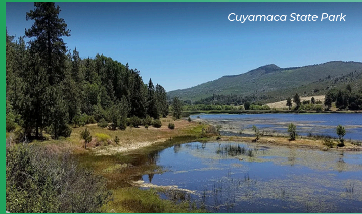
Cuyamaca State Park

https://en.wikipedia.org/wiki/Self-Realization_Fellowship