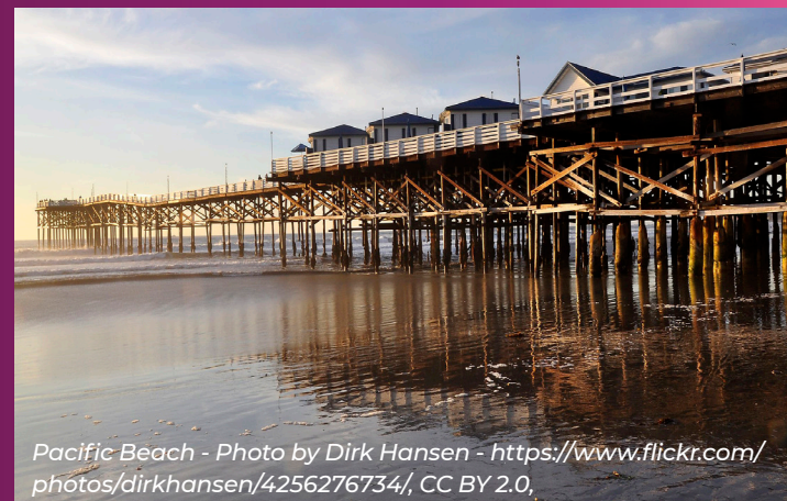
Pacific Beach