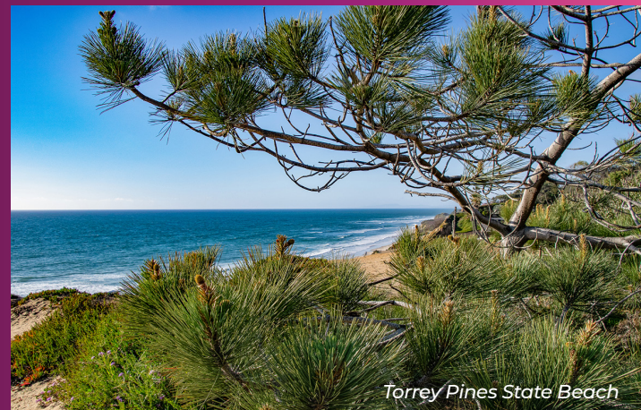
Torrey Pines State Beach